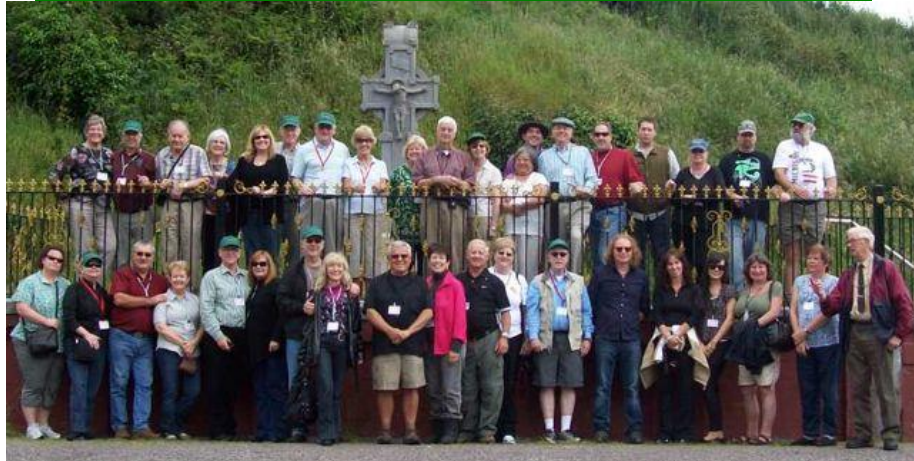
Clan at Michael Collins Memorial on ambush site of Beal na mBlath