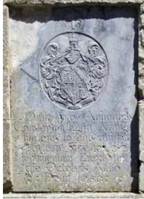
Constantine Egan plaque 1620